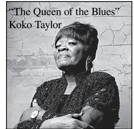
"The Queen of the Blues" Koko Taylor