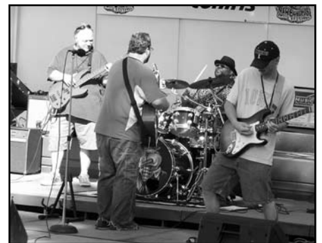
The Revival Band jamming it up on the New Bo Stage

It was a smorgasbord of music and entertainment. There were fifty bands on eight stages, food vendors, ten hours of live music, entertainment in the street, activity tents for children and the opportunity to meet a few thousand new friends. There just isn’t a better way to spend a warm Midwest Saturday afternoon and evening at summer’s end. The New Bo Fest ran four blocks of Third Street, so locating stages was easy and the exercise effort was minimal. The bands were carefully scheduled so that the entertainment was continual on each stage. I discovered you just could not go wrong making a selection on which band to listen to. Every stage had something of interest.