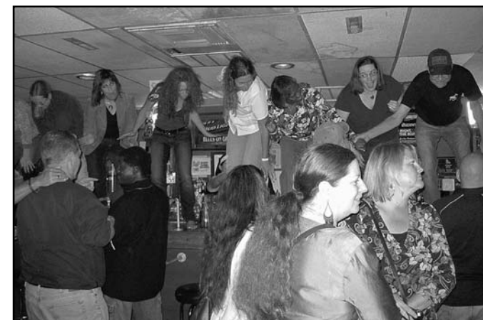
They weren't dancing in the streets but on the bar.